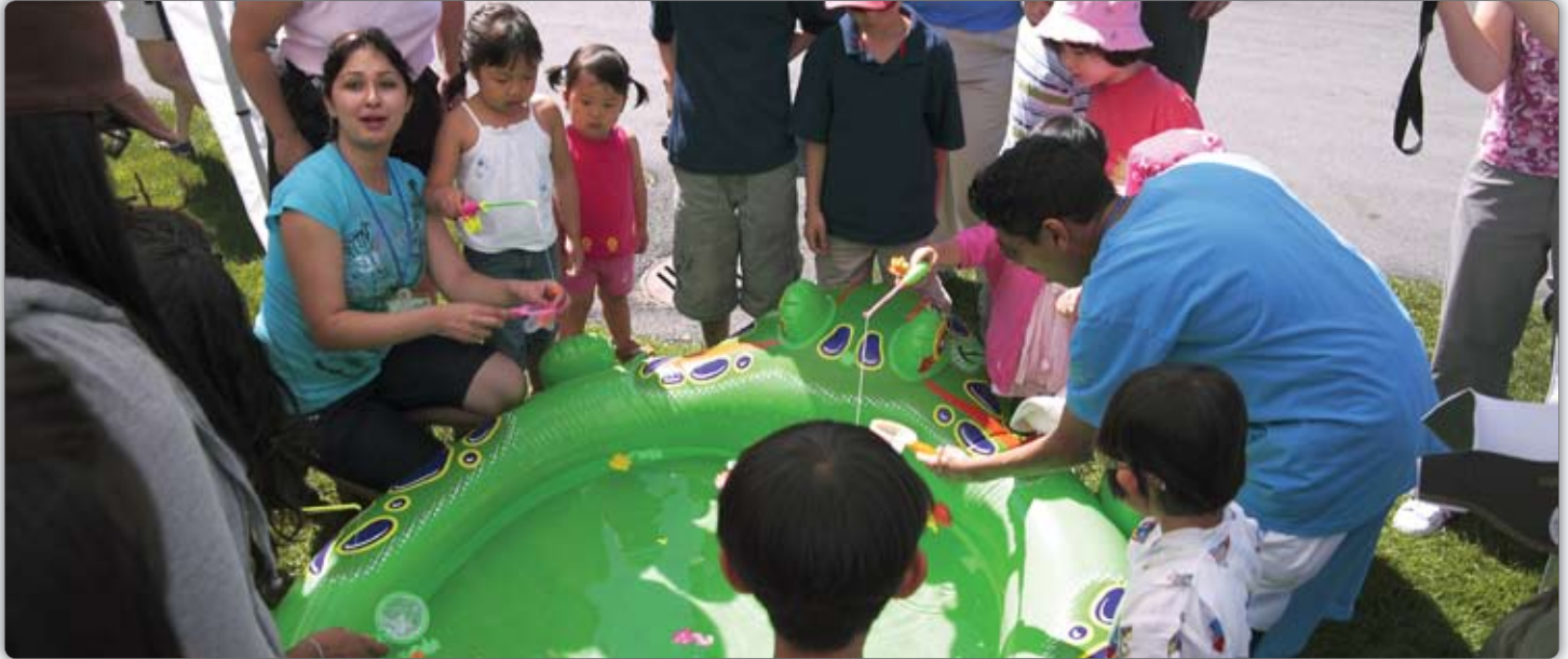
Discovery Day Festival