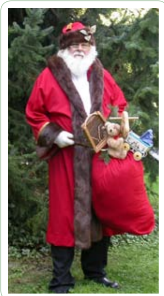
Father Christmas goes for a stroll

Take a trip back in time and head over to the Heritage Christmas at the Burnaby Village Museum! From November 22 to January 4, 2009, you can frolic in the streets with the infamous Gingerbread Man or help to Light up the Night with tree decorations that you can make yourself. There is always something to do during the day or well into the glittering and sparkling evening with your friends and family.